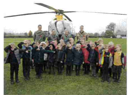
The STEM team visiting a local primary school

RAF Shawbury is justifiably proud of the support it provides to Cadet Forces. In 2023, the proactive Air Cadet Liaison Team organised four shooting events, five weeks of Annual Camp and 39 other events, which involved a total of 1123 cadets and Cadet Force Adult Volunteers. The Station also continues to inspire young people across Shropshire and neighbouring counties through its STEM programme, with No 1 FTS dedicating 63 hours of static aircraft in support of outreach visits. On six occasions aircrew landed the Juno in local playing fields to engage with children and young adults, fostering young peoples' interests in aviation, engineering, and Defence.