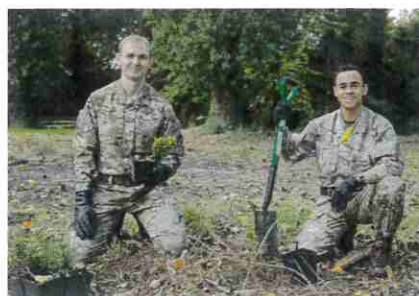
Hunkington Bee Community Project

To support our neighbours, all RAF Shawbury courses undertake community projects. We see this as an important aspect of the trainee's personal development and to contribute where we can to our neighbours, near and far. During 2023, some 18 community projects were undertaken, ranging from village litter picks to supporting a significant habitat restoration on an historical site. The Praise Bee Hunkington Manor Project is a remote medieval moated site, with some areas not accessed for 500 years. Our trainees cleared overgrown areas and planted over 1400 indigenous plants and flowers to develop a natural habitat for wildflowers and wildlife.