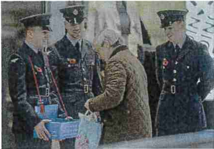
RAF Shawbury trainees at the Shrewsbury RBL Collection