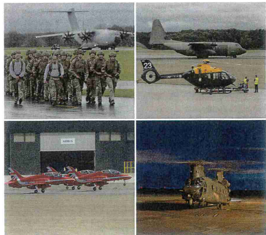
RAF Shawbury supporting front line training aircraft and the RAF Cosford Air Show

Engagement and Media General Enquiries: SHY-EngagementMediaTeam@modgovuk.onmicrosoft.com